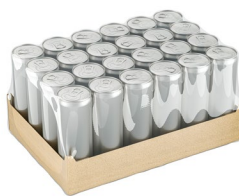
Basic For unprinted packages

Delivers a polished, professional appearance that drives appeal.