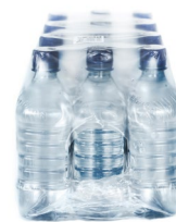
Mid-Level For printed and heavier packages