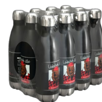
Premium For corrugated and other material replacement