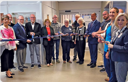
Phase 2 Ribbon Cutting at the Bluewater Health Cancer Clinic in April.