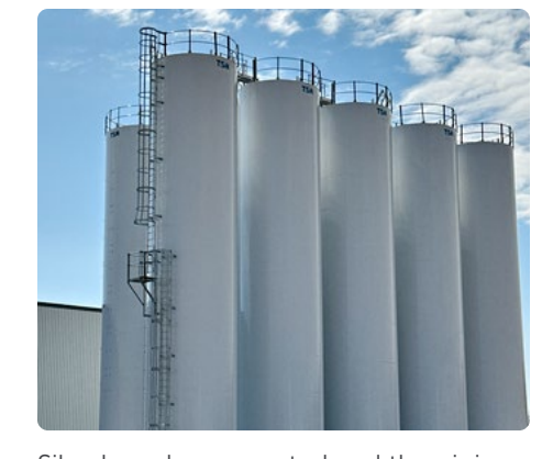
Silos have been erected and the piping for material handling is progressing as planned.