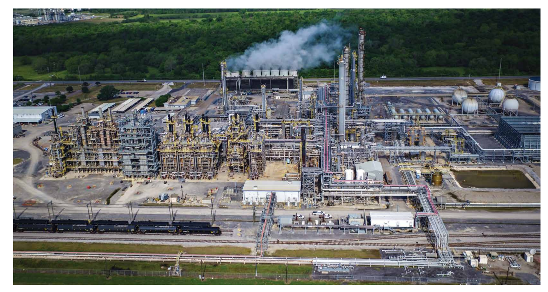
The Geismar Olefins Facility was a finalist for the Louisiana Chemical Association (LCA) Serious About Fostering Excellence (SAFE) Award for Best in Louisiana based on 2016 performance. SAFE is a voluntary LCA program designed to help members evaluate, monitor and improve both process and personnel safety as well as environmental performance.

In 2017, NOVA Chemicals acquired ownership interest in the Geismar Olefins Facility located about 21 miles (34 kilometres [km]) south of Baton Rouge and 60 miles (97 km) west of New Orleans (within both Iberville and Ascension Parishes). We also acquired about 525 acres (212 hectares) of undeveloped land adjacent to the plant.