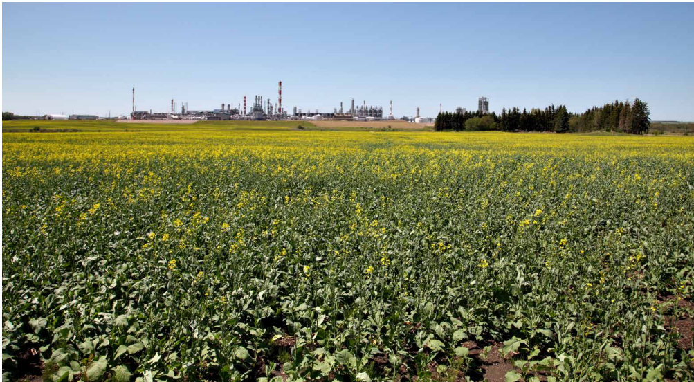
The spent lime / phosphate by-product enhances soil properties of locally acidic soils. The current method of application is spreading of the dry by-product.

Starting in 2021, the majority of costs associated with sampling, handling and spreading of the spent lime / phosphate by-product will be covered by NOVA Chemicals with a small portion of the costs being shared by the landowner.