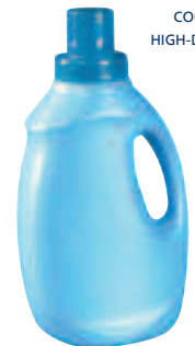
CONSUMER PACKAGING — HIGH-DENSITY POLYETHYLENE