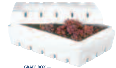
GRAPE BOX — EXPANDABLE POLYSTYRENE