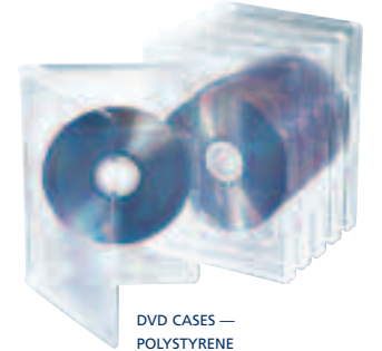
DVD CASES — POLYSTYRENE