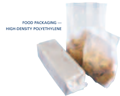
FOOD PACKAGING — HIGH-DENSITY POLYETHYLENE